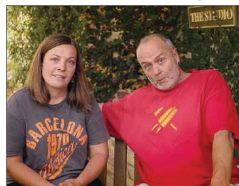
Top notch: The Be Ready Warrandyte video is booming.

To see the video visit YouTube and search for Be Ready Warrandyte – Do you have a fire plan?